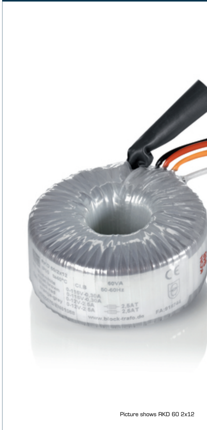
Picture shows RKD 60 2x12